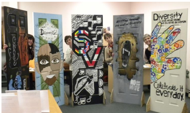
Doors of Diversity