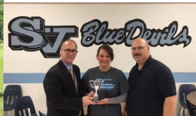
Healthy Shenandoah members receiving a trophy for winning the 2016 Walking Challenge