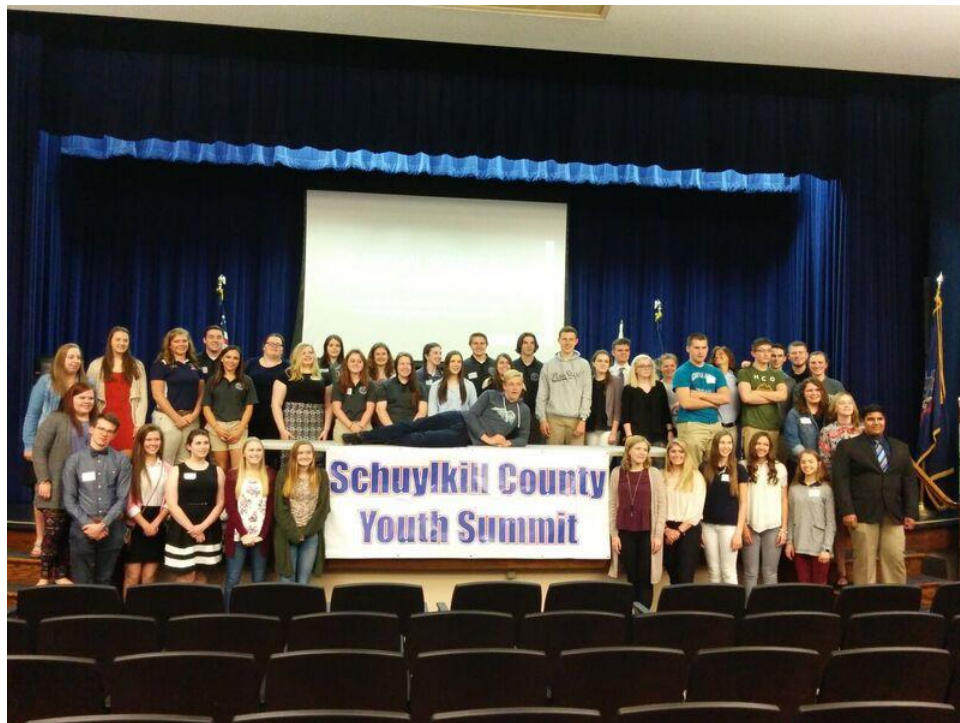
Students attending the Youth Summit at Penn State, Schuylkill Campus

Schuylkill County's VISION serves as the facilitator of the Schuylkill County Youth Summit since its inception. The goals of the Youth Summit are to engage, equip, and support our youth to create a great future for Schuylkill County. Below are some of the ways VISION has facilitated this process in the past year.