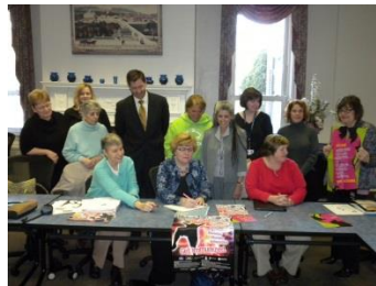
The members of the Schuylkill County Immunization Coalition