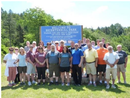
Shenandoah's Bicentennial Park rededication