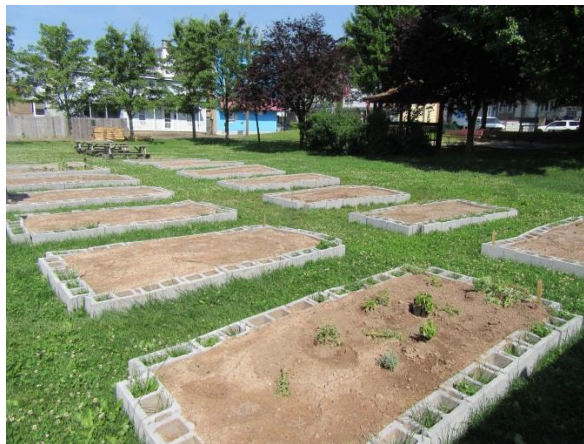
Mahanoy City Community Garden, phase 1